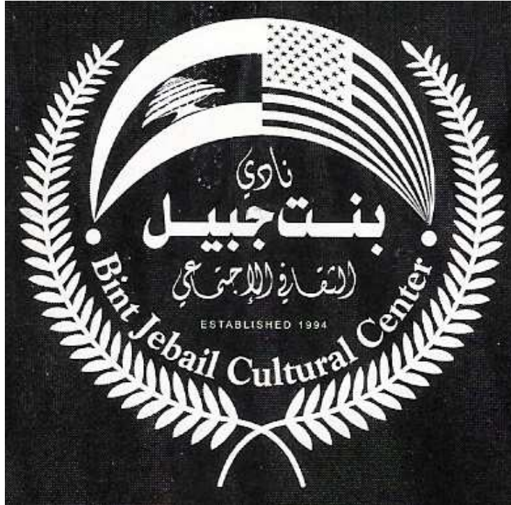
Hezbollah Club on Our Shores (One of Several)